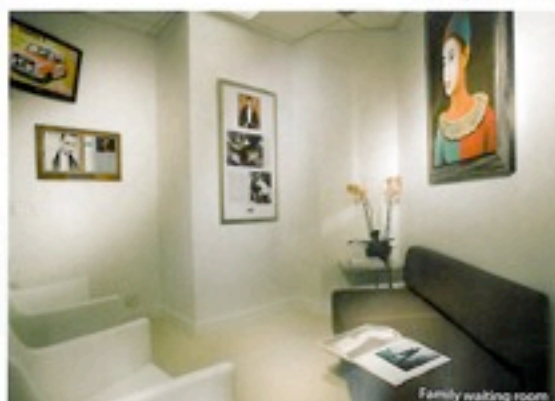
Family waiting room